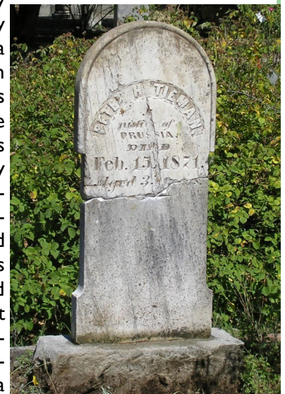
TYPICAL MARBLE CEMETERY HEADSTONE